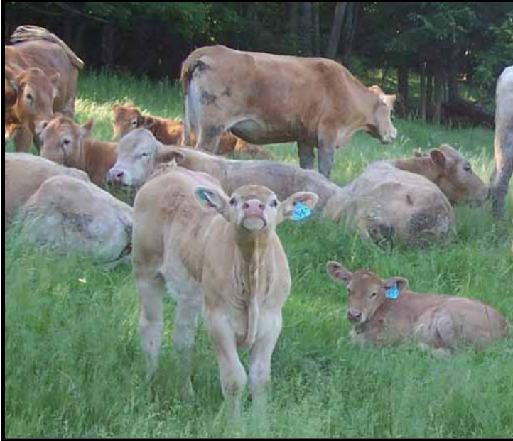
This month's "Nosey" winner - Kirk McGee, Ontario. See Page 8 for more.