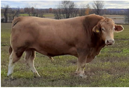
Grand Champion Bull Langstaff Frank 8F Stonewall Farms, ON