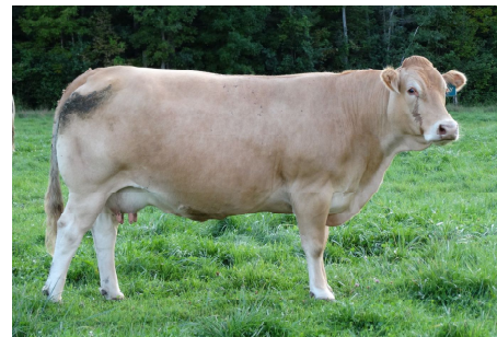
Reserve Champion Female WSS Yttrium 3Y Crystal Farms, ON

Thank You to all those that exhibited and sponsored the show in order to make the Show a great success