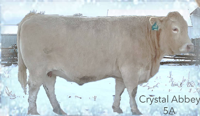
Crystal Abbey 5A