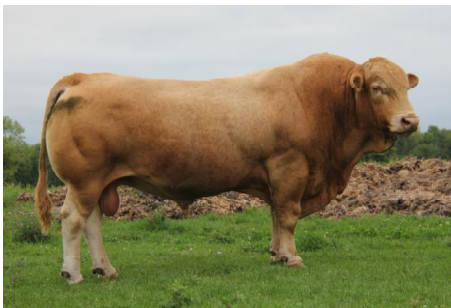
Reserve Champion Bull WSS Celebration 2C Crystal Farms, ON