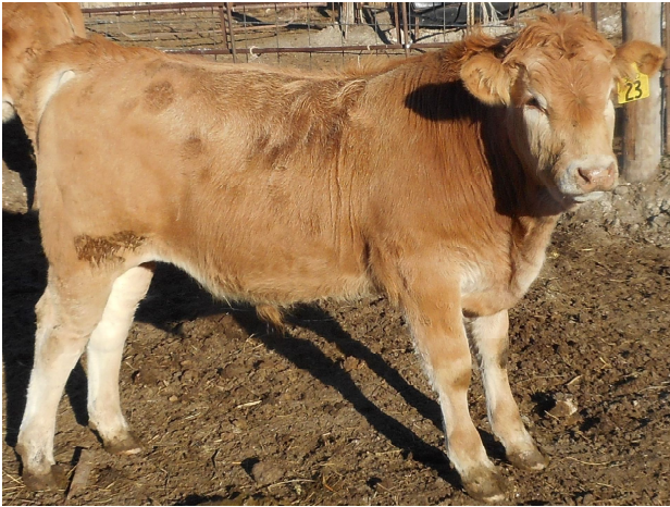
FORTY ACRE HARDCORE 23 H (FB) FORTY ACRE ETHAN - -FORTY ACRE DAISY