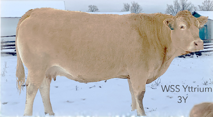
WSS Yttrium 3Y