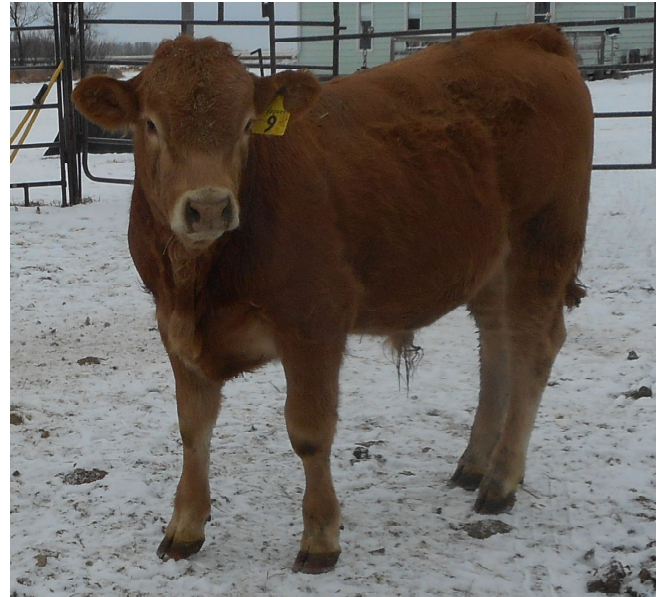
FORTY ACRE HUGGER 9H (FB) FORTY ACRE ETHAN- WEST WINDS YOGURT