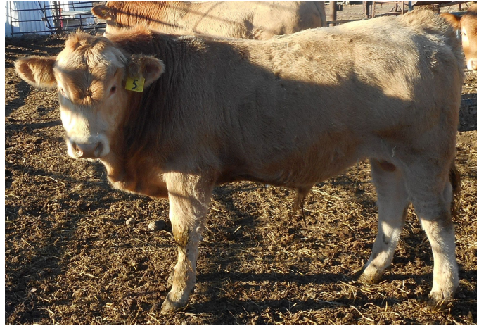
FORTY ACRE HENRY 5H (PB) BARK DIABLO - FORTY ACRE DENA