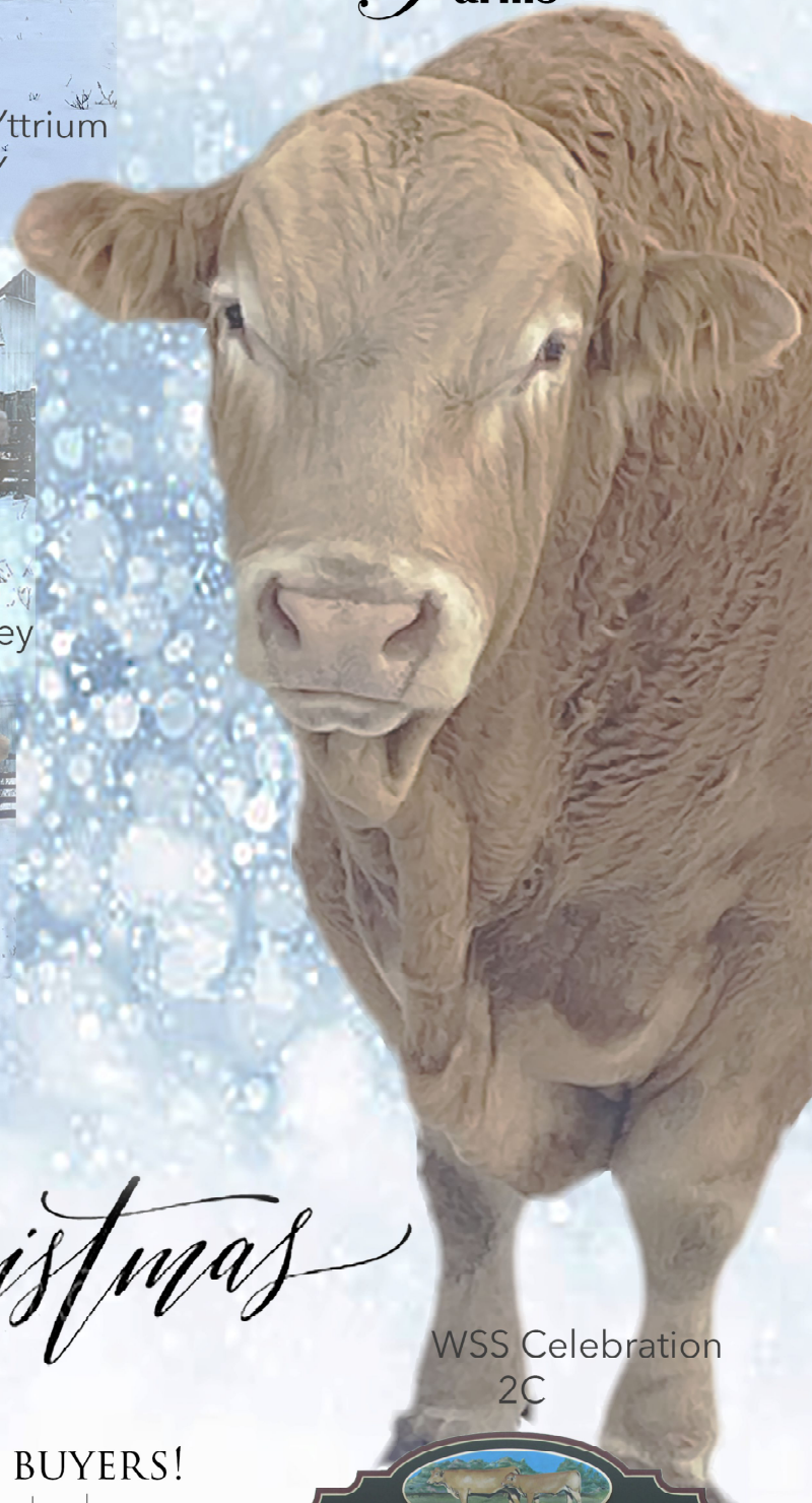
WSS Celebration 2C