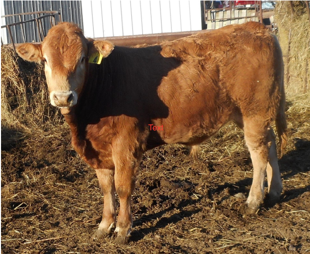
FORTY ACRE HIYA 4 H (PB) WEST WINDS CENOVOS-FORTY ACRE YOUTBETCHA