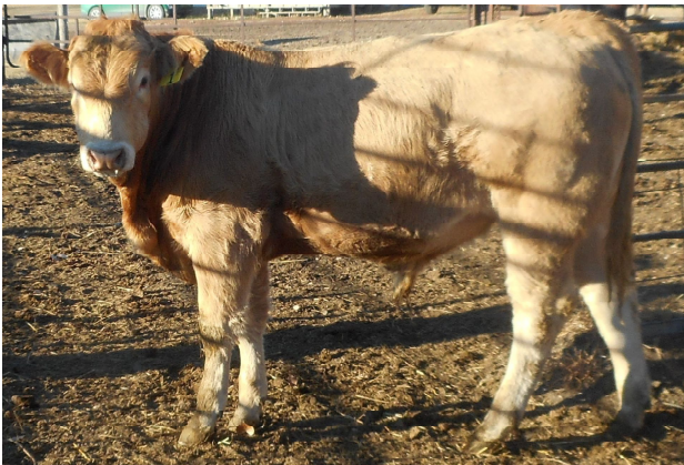
FORTY ACRE HORACE 1 H (FB) FORTY ACRE ETHAN - FORTY ACRE DOROTHY