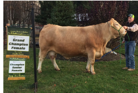
Grand Champion Female Little Creek Apricot Fee Haven Farms, ON