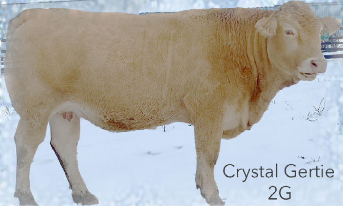
Crystal Gertie 2G