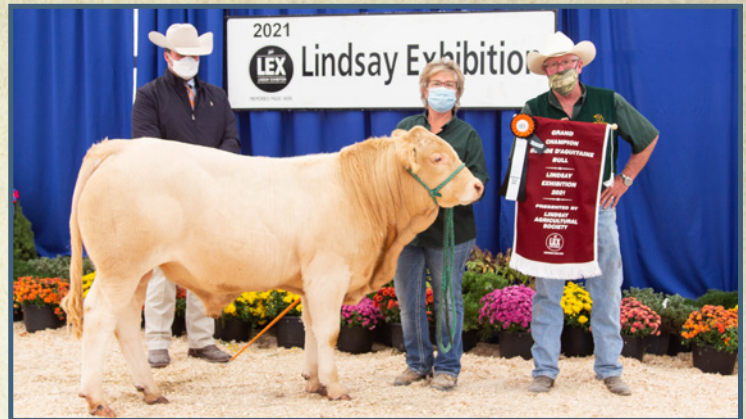
GRAND CHAMPION BULL Donaleen Jackpot 1J / Donaleen Blondes