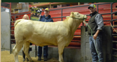
PEOPLE'S CHOICE CONSIGNOR HARMONY