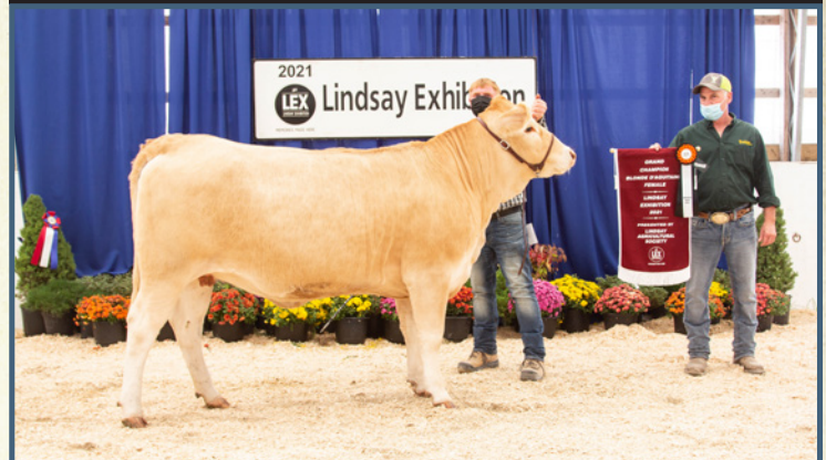
GRAND CHAMPION FEMALE Shelbramack Harmony 04H / Shelbramack Blondes