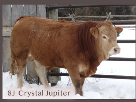
8J Crystal Jupiter