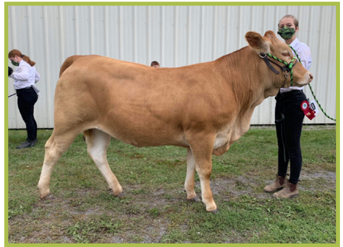
SOPHIE MAHEU with heifer

PLEASE SEND US YOUR 4-H RESULTS AND PICTURES SO WE CAN INCLUDE THEM IN THE 2023 PUBLICATION!