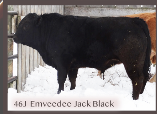
46J Emveedee Jack Black