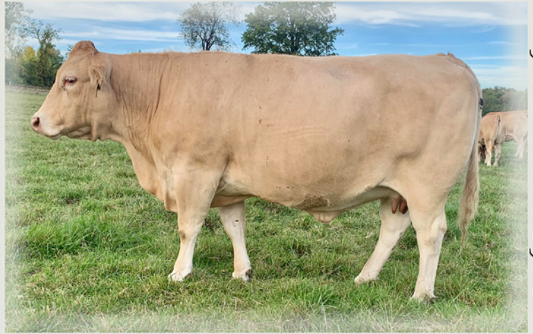
Crystal Abbey 5A