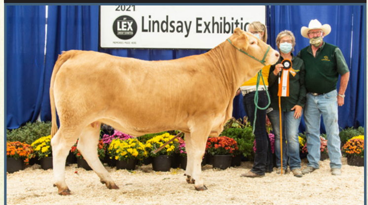
RESERVE GRAND CHAMPION FEMALE Donaleen Hazzel Nut 11H / Donaleen Blondes