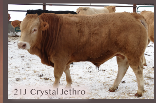
21J Crystal Jethro