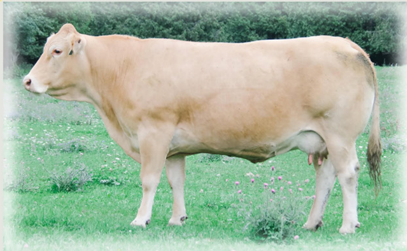
WSS Yttrium 3Y

STOP IN ANYTIME TO VIEW THE HERD! OFFSPRING FROM POWERFUL COWS LIKE THESE FOR SALE THIS FALL!