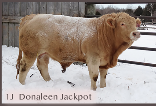
1J Donaleen Jackpot

contact owners for more information | bulls for sale