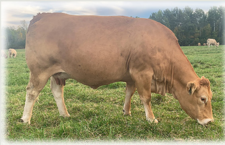
Crystal Dawn 23D

STOP IN ANYTIME TO VIEW THE HERD! OFFSPRING FROM POWERFUL COWS LIKE THESE FOR SALE THIS FALL!