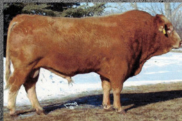
WEST WINDS GERSHWIN 147G