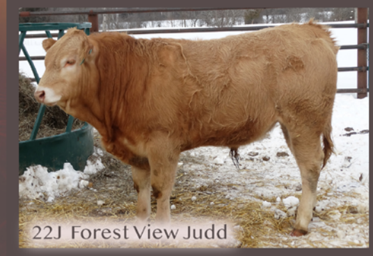
22J Forest View Judd