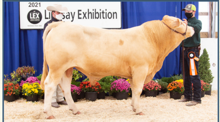
RESERVE GRAND CHAMPION BULL Shelbramack Heat Seeker 42H / Shelbramack Farms