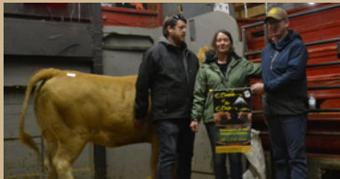
PEOPLE'S CHOICE CONSIGNOR GUMDROP

CRYSTAL JAZZBERRY 34J $2000 Consigned by Crystal Farms, Purchased by Little Creek Farms, Ellscoot, AB