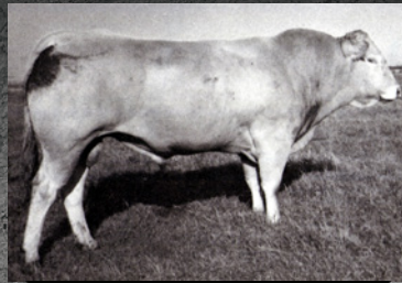
MARKWOOD WOODROW T LUKE