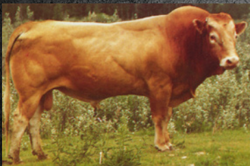
VAN ALTA LUCKY BOY