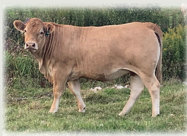
Crystal Honey 13H