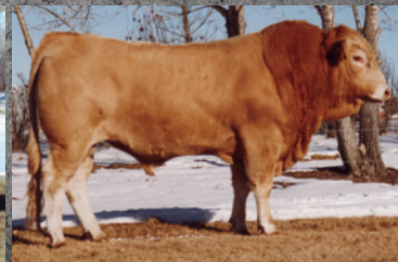
WEST WINDS HERDSMAN 32H