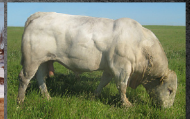
WESTWINDS WORKMAN 94W