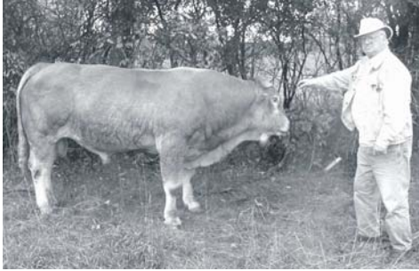
Polled Fullblood Herdsire