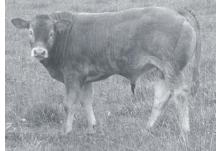
Polled March Calf