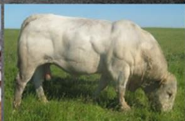
WESTWINDS WORKMAN 94W