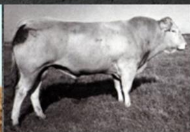
MARKWOOD WOODROW T LUKE