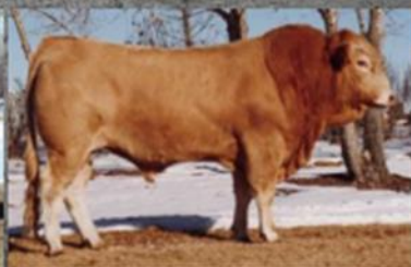
WEST WINDS HERDSMAN 32H