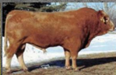
WEST WINDS GERSHWIN 147G