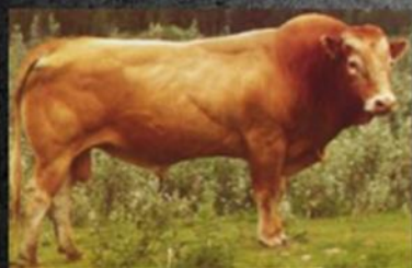
VAN ALTA LUCKY BOY