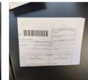
Fold the form one more time so that the hair is on the inside of the fold and the barcode on the form is facing outwards