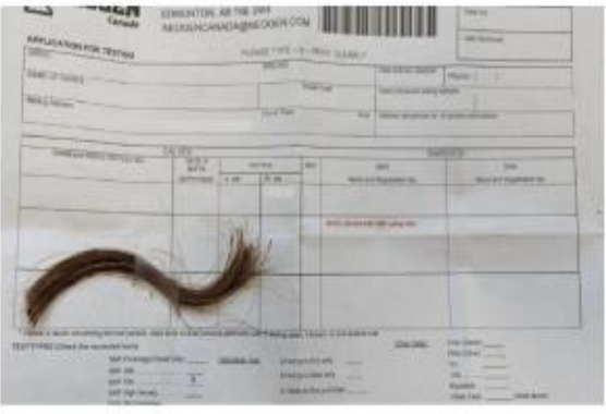
Tape the hair on the left half of the form underneath the Name and Registration number box