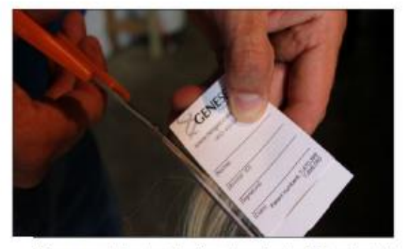
Trim excess hair extending from the collector. Write animal ID and other information in the spaces provided.