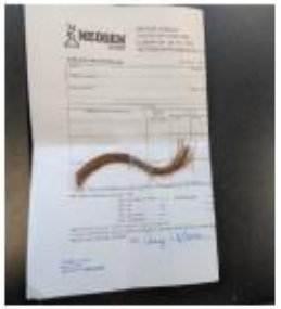
Fold the form in half length wise